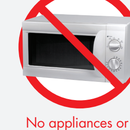
It is ILLEGAL to dispose of hazardous materials in your garbage or recycling containers.

Containers found to have these materials will not be collected until such materials are removed.