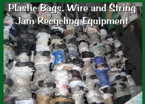
Plastic Bags, Wire and String Jam Recycling Equipment

Please do not place recyclable items in plastic bags. Recyclable items should be placed loose in your recycling cart. Plastic bags are not accepted in our recycling program and when placed in the recycling cart will cause our sorting equipment to jam.