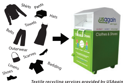
Textile recycling services provided by USAgain.

Caution kids to stay 50 feet away from the back of our trucks for their safety